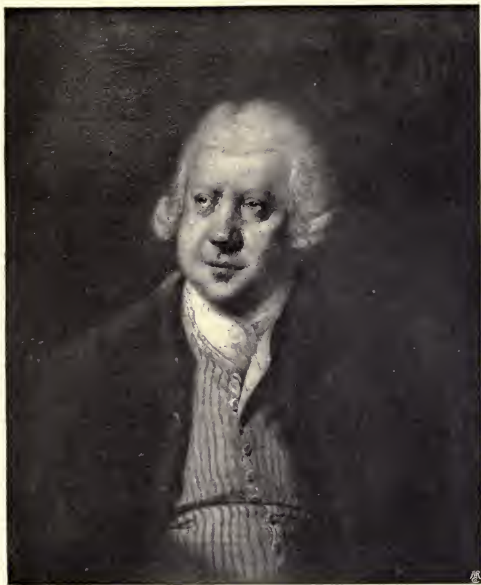
SIR RICHARD ARKWRIGHT, 1732-1792.